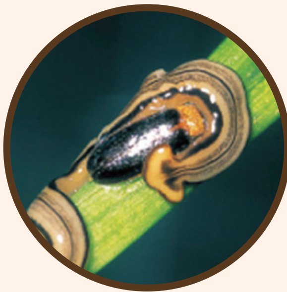
Bipalium prey on Luciola cerata .