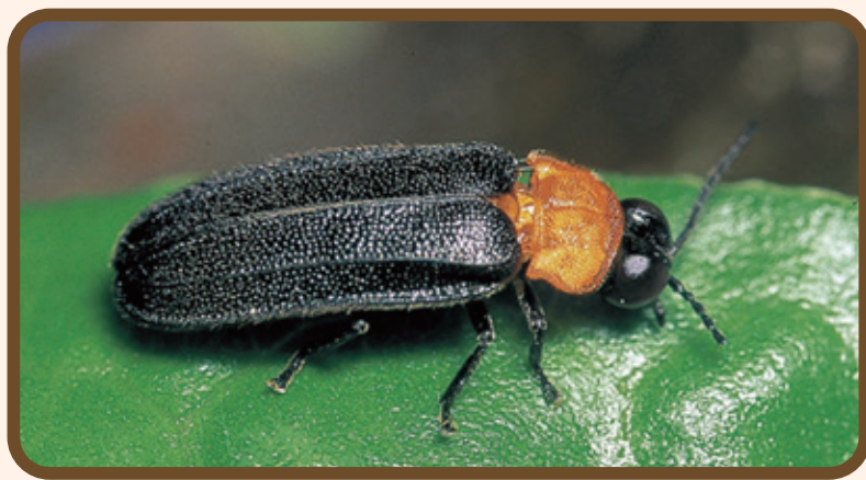
Curtos mundulus (Nocturnal)

Occurrence : April - June Body length : about 6 -11mm