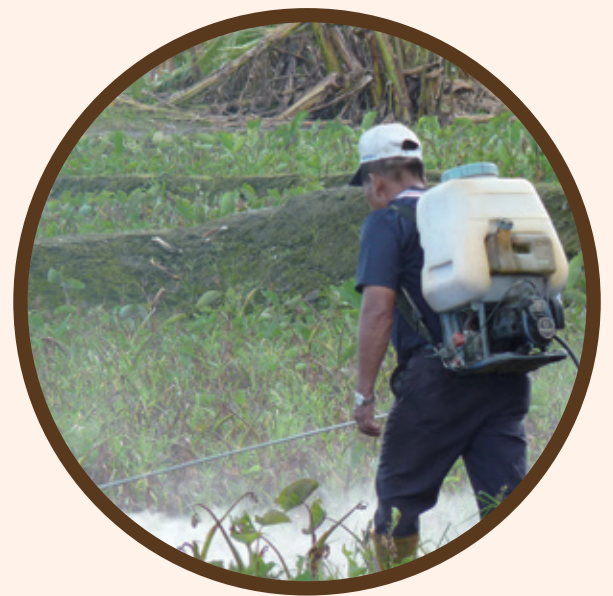
Excessive Use Of Herbicides