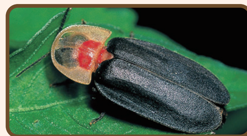
Diaphanes formosus (Nocturnal)

Occurrence : November - December Body length : ♂ about 13-16mm ♀ about 20-32mm