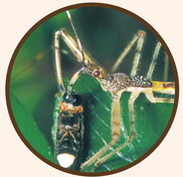
Tessaratomya papillosa prey on Luciolafiliformis .

The primary predators of fireflies are spiders. In natural ecosystems, spiders have always played an essential role as predators, but thanks to the existence of spiders, a balance has been maintained in the system. In addition to spiders, Tessaratomya papillosa and frogs are also natural enemies of fireflies, and even Bipalium among Platyhelminthes feed on fireflies. In the case of a firefly surrounded by enemies, there is a defense system in place. When frightened, the firefly will secrete a foul-smelling "odor" from under its wings or from the end of its foot appendages to scare off or exasperate its enemies. However, if the odor doesn't work, then all they can do is simply hang back and wait for their fate.