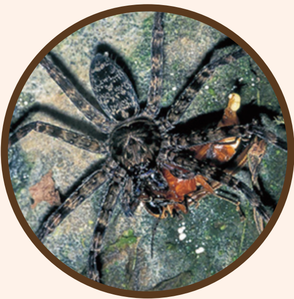
Heteropoda venatoria prey on Luciola anceyi .

Nature abounds in brutal competition and survival. Fireflies must have unique survival skills and strategies in order to survive and successfully complete the task of generational succession. So how do fireflies protect themselves? And what are their enemies?