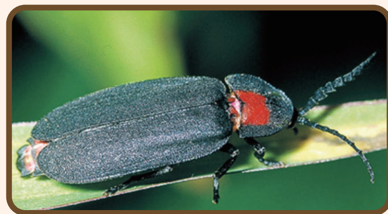
Pyrocoelia formosana (Nocturnal)

Occurrence : October-the following January Body length : ♂ about 17-22mm ♀ about 26.5-28.3mm