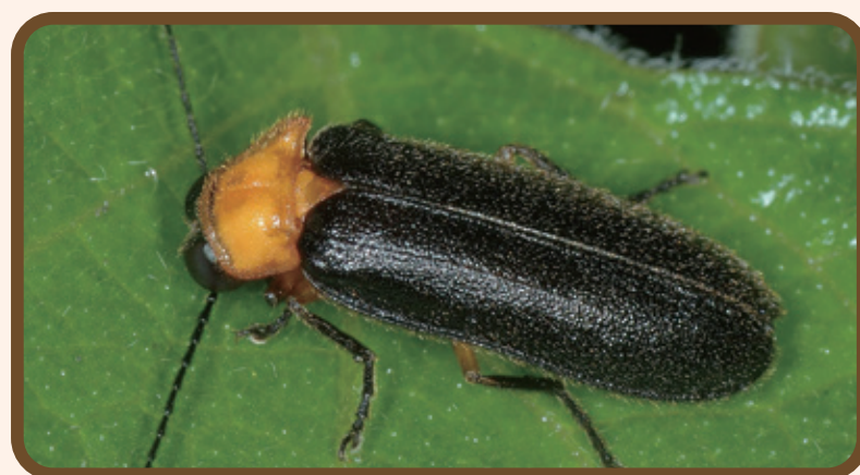
Abscondita ceratas (Nocturnal)

Occurrence : March - June Body length : about 10 -12mm