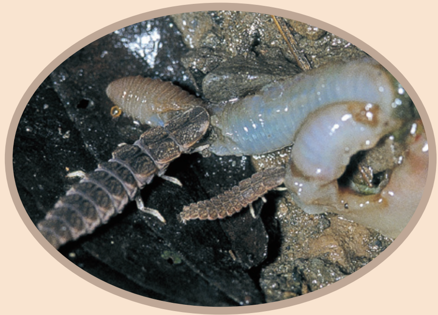
Diaphanes citrinus larvae prey on earthworm.