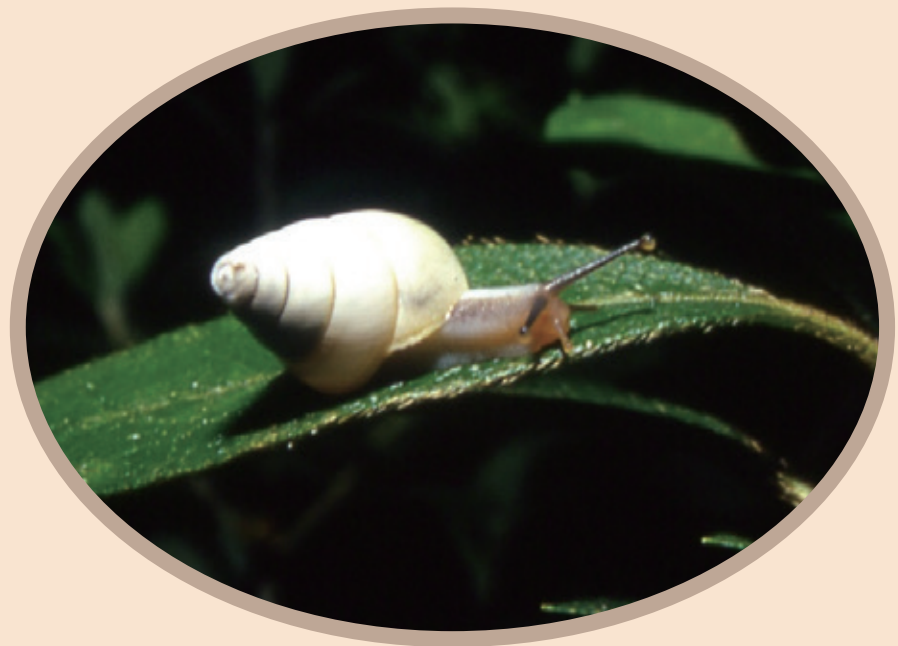
Food for fireflies - Satsuma albida.