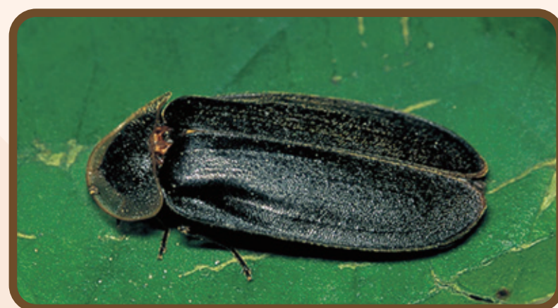
Lamprigera yunnana (Nocturnal)

Occurrence : March - December Body length : ♂ about 12-15.7mm ♀ about 19.1-20mm