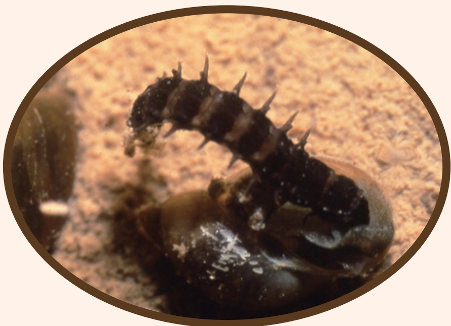
Luciola cerata is drinking water

Adults only feed on dew and nectar, while larvae feed mainly on snails, snails, and earthworms. Unfortunately, adult fireflies in Taiwan have no hunting function due to degeneration of the mouthparts, so they only consume dew and nectar.