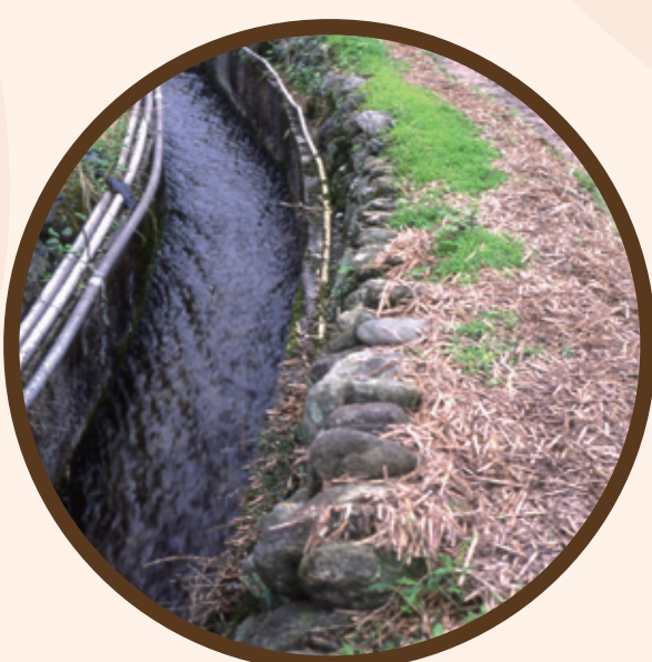
Cementing Of Slopes

In the face of destruction and threats to the environment, fireflies are threatened with extinction. In Taiwan, what are the common challenges to fireflies? What can we do for them, so they can resume their presence on Earth?