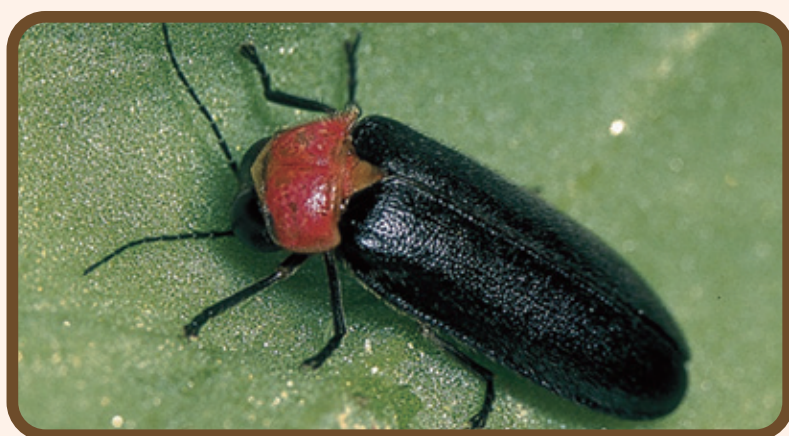
Luciola kagiana (Nocturnal)

Occurrence : March - June Body length : about 10 -12mm