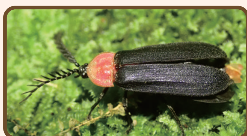
Vesta chevrolati (Nocturnal and Diurnal)

Occurrence : May - August Body length : about 15 - 19mm