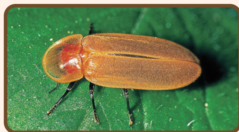
Diaphanes citrinus (Nocturnal)

Occurrence : April - June Body length : ♂ about 17-22mm ♀ about 26.5-28.3mm