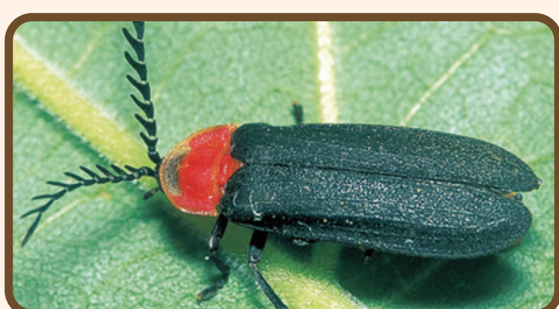
Vesta impressicollis (Nocturnal and Diurnal)

Occurrence : April - June Body length : about 6 - 7mm