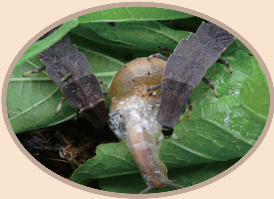
Lychnuris praetexta prey on Acusta.