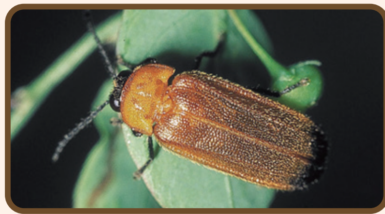
Curtos costipennis (Nocturnal)

Occurrence : April - September Body length : about 6 - 8mm