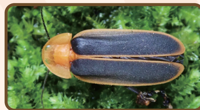
Pyrocoelia analis (Nocturnal)

Occurrence : March - June Body length : ♂ about 9-12mm ♀ about 13-15.7mm