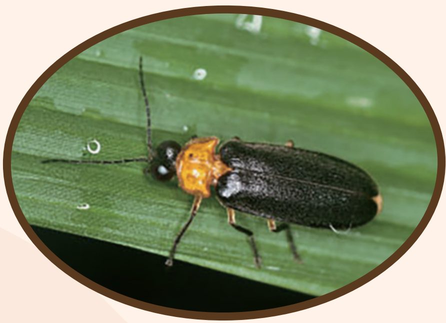
The larvae of Aquatica ficta preying on Harpago chiragra