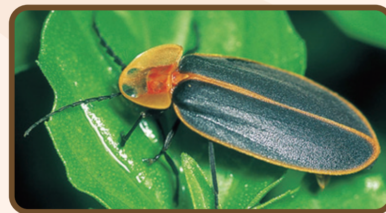
Lychnuris praetexta (Nocturnal)

Occurrence : October-the following January Body length : ♂ about 17-22mm ♀ about 26.5-28.3mm