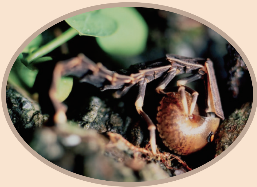
Lychnuris praetexta larvae prey on snails.