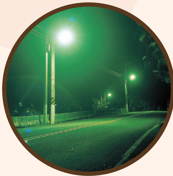
Installation Of Streetlights