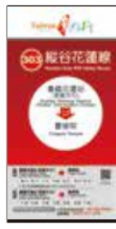
Taiwan Tourist Shuttle Stop